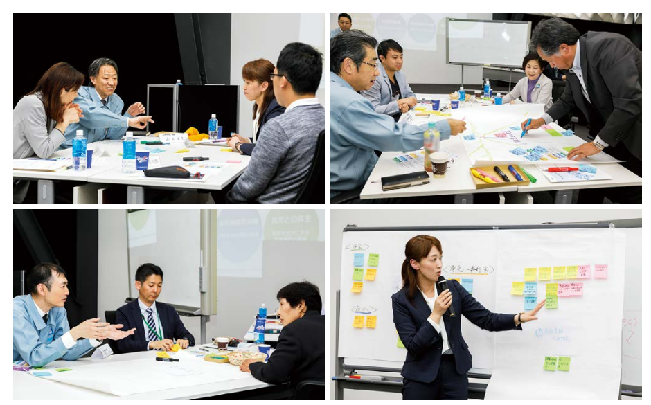
Participants and employees formed groups to share opinions and present their ideas

In addition to creating forests, which the YKK Group is putting its efforts into, there are environmental issues that need to be dealt with in Kurobe, such as the accumulation of sediment in dams and seashore erosion. I expect the Group together with its stakeholders to consider innovative methods and engage in solving these issues. In addition, I hope that Kurobe can make use of its location connected to Osaka and Tokyo by the Hokuriku Shinkansen and its beautiful natural environment to hold environment summits and other events in Kurobe or otherwise serve as a place to spread environmental measures.