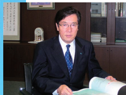
YKK Group Environmental Policy Committee Chairman YKK Corporation Representative Director and Vice Chairman