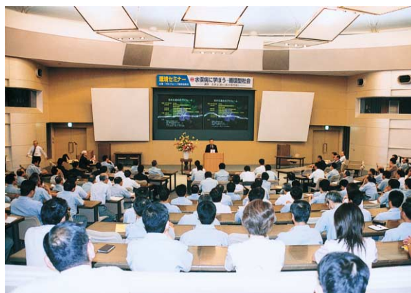
Masazumi Yoshii, the former Mayor of Minamata, gives a presentation at a seminar on the environment (September 18, 2002)

He explained that, by undertaking environmental protection activities with clear principles, the small efforts of each individual can add up to big results. We were able to see how our environmental protection efforts in each area of our work have an impact.