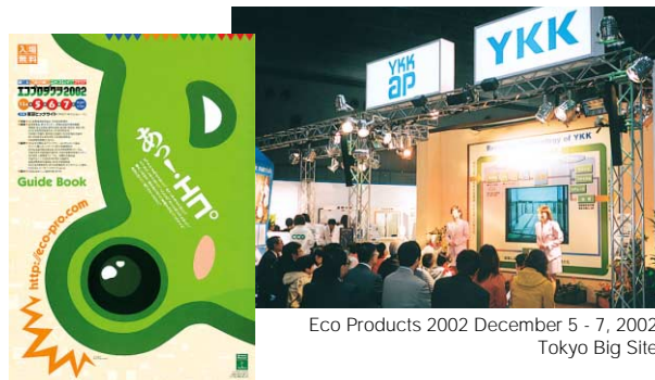
Eco Products 2002 December 5 - 7, 2002 Tokyo Big Site

With the concept of "providing environmentally sound products widely to society" we sponsored an exhibit at Eco Products 2002. We provided a hands-on corner for people to learn about environmentally friendly products, including insulating APSWORD Wood sashes, which are easy to disassemble and recycle when they are no longer needed, and our biodegradable Hook and Loop Fasteners which are made mainly of polylactic acid, a plant-based material with low environmental impact.