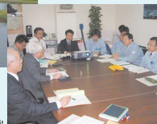
During an audit