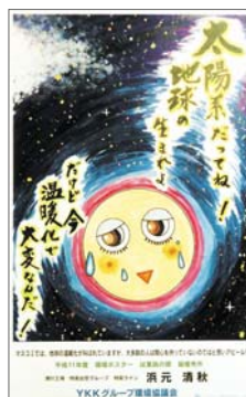
Environmental poster (employee)