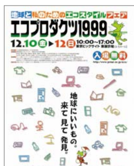
Eco Products 1999 December 10 - 12, 1999 Tokyo Big Site

The YKK Group participates in environmental exhibitions in order to let people know about our environment-friendly products and efforts to conserve the environment.