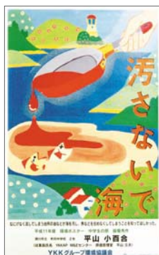
Environmental poster (junior high school student)