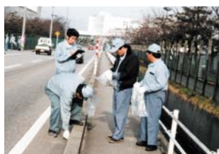
Cleaning Volunteer Activities at Kurobe Manufacturing Center

Through employee education, the YKK Group participates in environmental conservation and volunteer activities both in the company and outside.