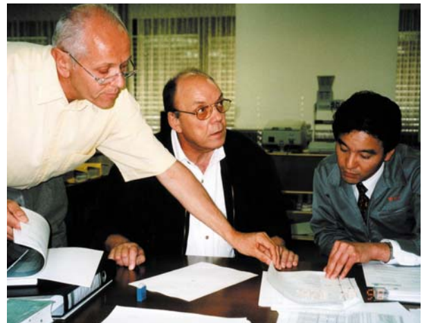
Inspection at overseas factory

Items concerning environmental risk have been added since FY 2000 in order to prevent accidents involving the environment from happening, so we can interact with each other safely.